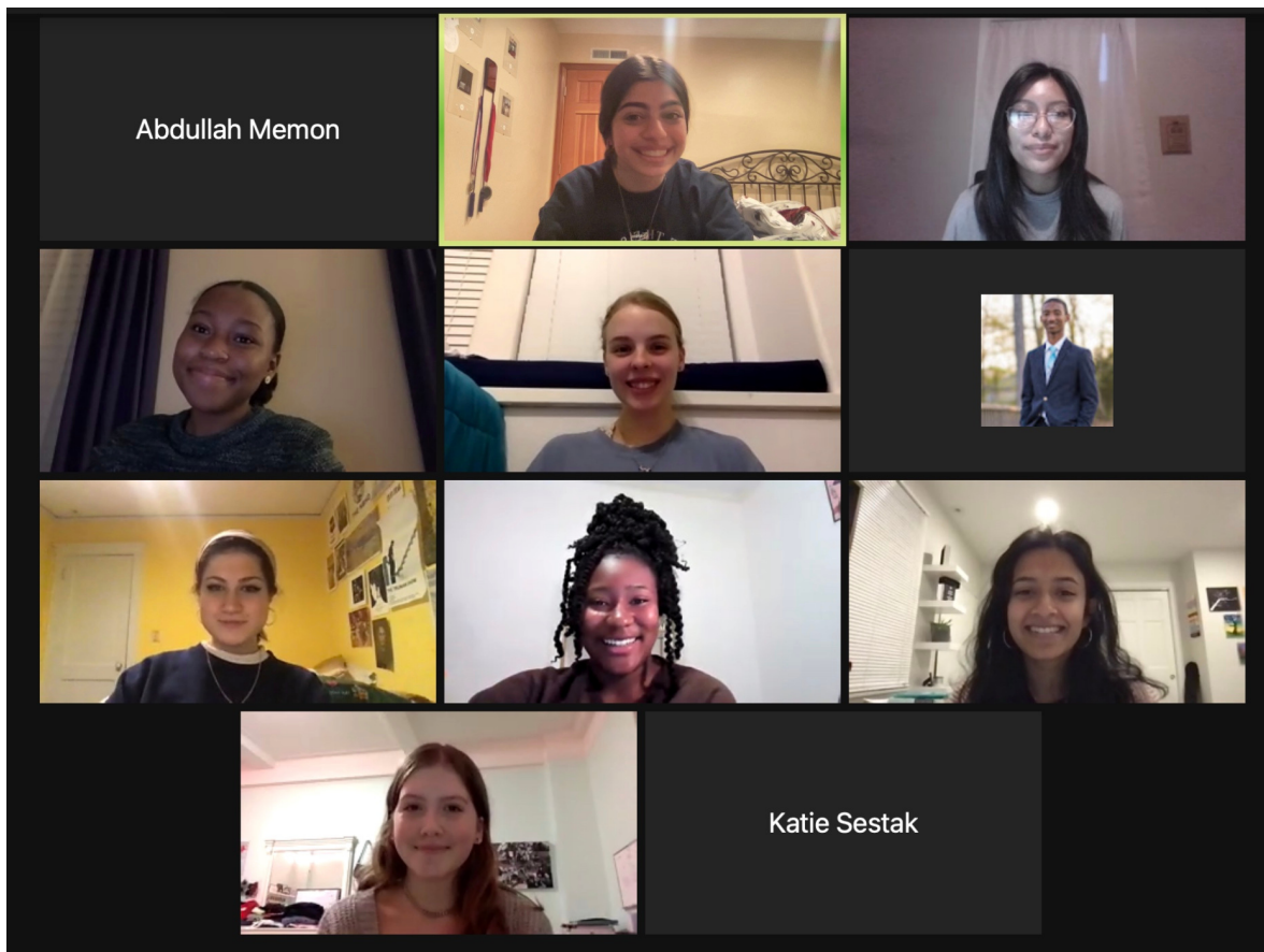
Picture above is our first Nationwide Chapter Leads Meeting through with the New Executive Board.